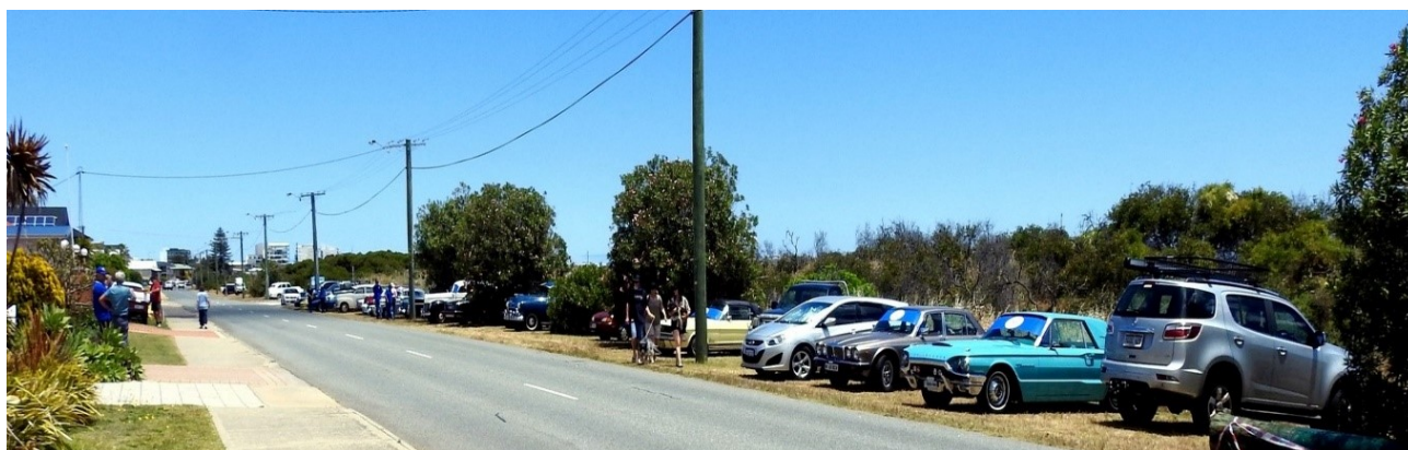
All the cars parked up across the road from Tucker's