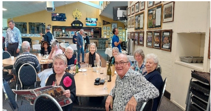
Members of the Swan Athletics Club