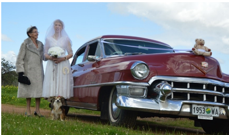
1953 Cadillac owner-Domenic Paoliello Models-Loris Cooper and Christel Ferrari

The overarching sentiment of the 50s was "New and Improved" this sentiment washed into not only fashion but every aspect of life. With the hard times of the depression and war behind them, the growing middle class of the 1950s started to live their lives in different ways. Prosperity brought the concept of leisure into the mainstream, as holidays and air travel became more affordable designers responded to the growing market with a new category of clothing. "Resort Wear", although it implied casual, people dressed it up, it was more colourful and revealing than everyday wear. Playsuits, beach dresses, bathing suits and cover-ups in vivid colours, including Hawaiian, Indonesian Batik, and animal prints. Cocktail parties were part of the changing world, this is when we see the emergence of the cocktail dress, worn with veiled cocktail hats and gloves. The formal mid-calf length dresses in luxurious fabrics were designed to wear between 5 and 8pm. There was also a trend for ballerina length wedding dresses, often made of or incorporating copious amounts of lace.