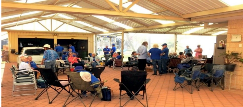
Having lunch under the patio