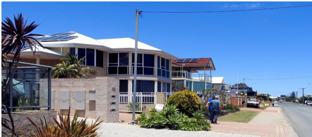
Brian & Mary Tucker's beautiful home on Rockingham Beach Road